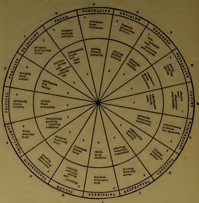
FIG. 2. Level II and III variables: interpersonal traits with illustrative adjectives at two degrees of intensity.

ings of 2 represent for the most part what may be described as flexible or appropriate perception, while consistent ratings of 1 or 3 would tend to indicate probabilities of rigidity or imbalance in perception of self and other. Thus, one type of personality abnormality may be considered to be rigid imbalance in perception of self or other at either the conscious or private levels. The concepts of parataxic experience of Sullivan and transference of psychoanalysis appear to be examples of such rigid imbalance of perception. Thus, possibilities exist for objective or quantitative description of such concepts.